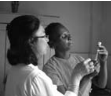
A community-based family planning worker prepares to give a practice injection as a trainer supervises during a three-day training session.