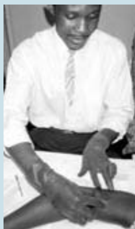
A doctor inserts Norplant capsules. Compared with Norplant, the implants just entering the market are easier to insert and remove.

1 Hubacher D, Kimani J, Steiner MJ, et al. Contraceptive implants in Kenya: current status and future prospects. Contraception 2007;75(6):463–73.