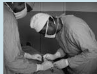
A health care worker performs a female sterilization procedure in rural Uganda. Sterilization and other LAPMs can be appropriate contraceptive options for most people living with HIV.

LAPMs are suitable options for most women and couples who want to prevent unintended pregnancies. Women living with HIV may rely on an IUD, implant, or female sterilization for contraception, with only two exceptions. If a woman has an AIDS-related illness, she should postpone surgical sterilization until after her condition improves. And IUD insertion is not usually recommended as a first choice for a woman who has developed AIDS if she is not on antiretroviral therapy or is not responding to treatment. This is because her suppressed immune system could increase the risk of infection during