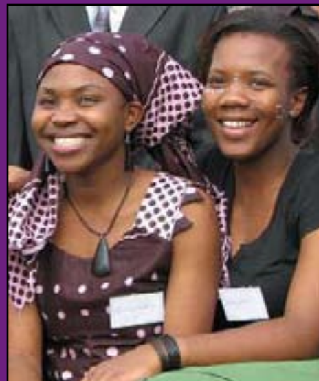
YouthNet/Family Health International

Africa Regional Forum on Youth Reproductive Health and HIV June 6-9, 2006 Dar es Salaam, United Republic of Tanzania