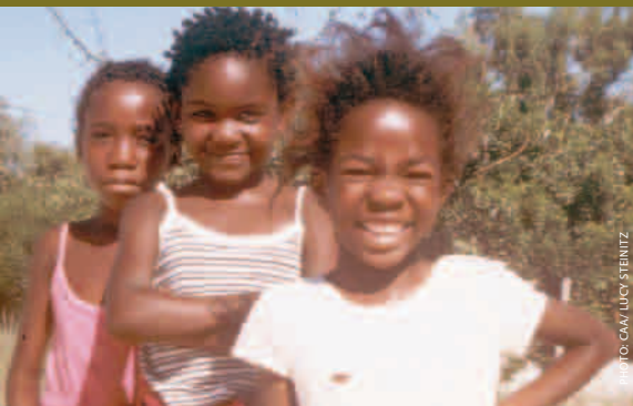
YOUNG NAMIBIAN GIRLS PARTICIPATE IN AN AFTER-SCHOOL PROGRAM RUN BY CATHOLIC AIDS ACTION ORGANIZATION WITH FHI SUPPORT

The Republic of Namibia is known for its breathtaking sand dunes and diverse ecosystems. With a population of just 1.8 million and more than 20 percent of sexually active adults infected with HIV, Namibia ranks among the worst affected countries worldwide in terms of HIV prevalence. FHI supports national and local government agencies, AIDS service organizations, faith-based hospitals and faith-based organizations to implement programs for the general population as well as targeted programs for the workforce, youth, pregnant women, and orphans made vulnerable by HIV/AIDS.