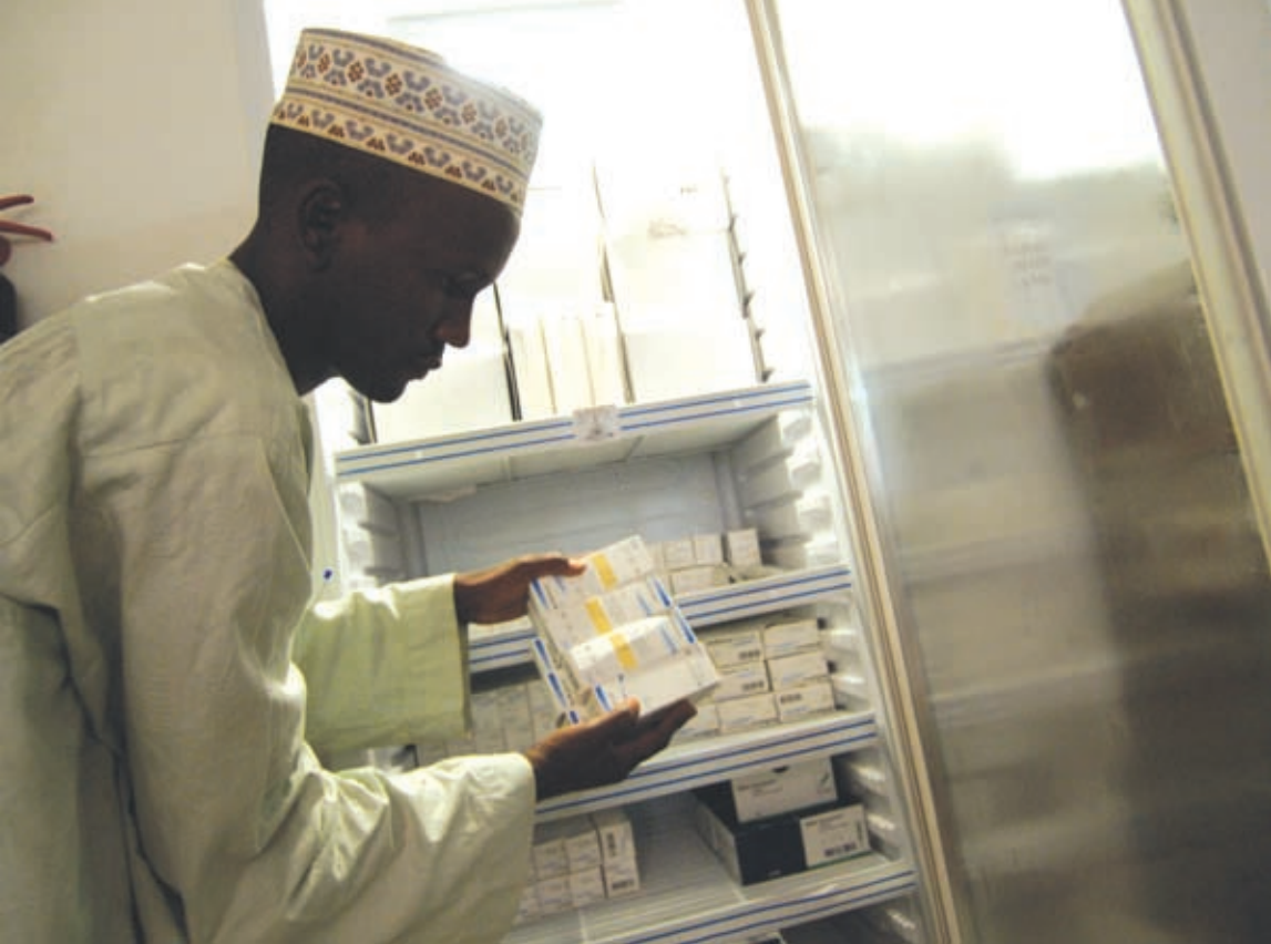
A GHAIn logistics officer with drugs in storage

evaluation, and client education management have been enhanced in 98 GHAIN-supported comprehensive sites (mainly general hospitals) throughout Nigeria. GHAIN-supported ART services integrate prevention into care and treatment and promote treatment adherence and management of opportunistic infections. PLWHA are linked to treatment sites, support groups and community-based organizations through the enhanced referral system.