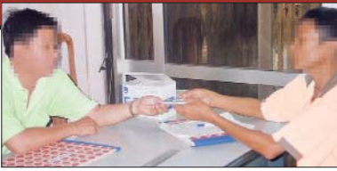
Club members receive free counseling and risk reduction materials.